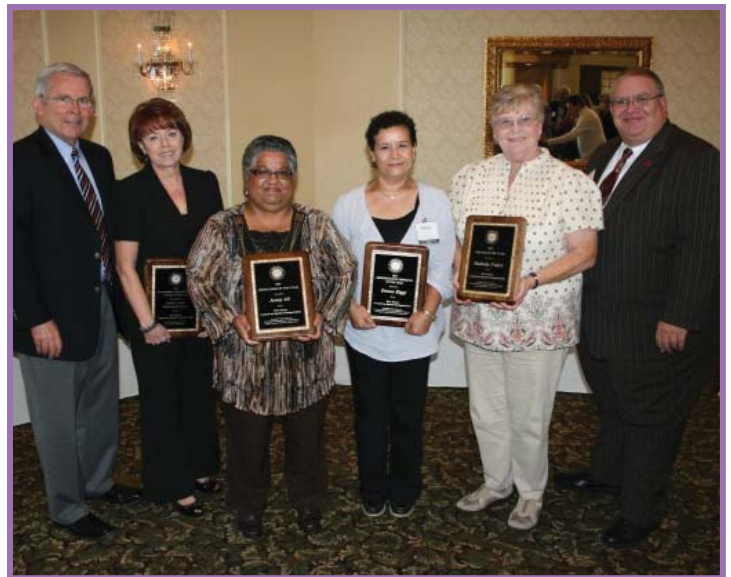
The New Jersey Council on Special Transportation (COST) presented their yearly recognition awards at their annual COST Vendor Expo held at the PNC Bank Arts Center in Holmdel, New Jersey.