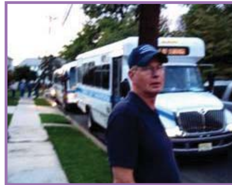
A driver waits for the National Guard to bring residents to an evacuation point in Bound Brook, NJ.

orders were in place and being executed, and everywhere across the state, county transportation systems were assisting in moving residents to safety and providing critical